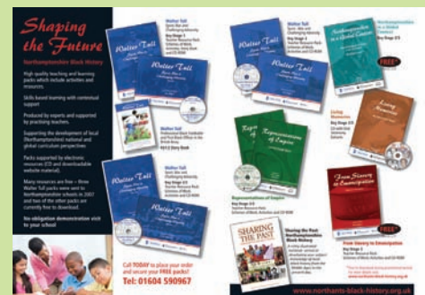
Creative approaches to teaching

Why not log on to the NBHA website now and take advantage of the FREE downloads worth £40. ( www.northants-black-history.org.uk )