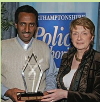
Unsung Hero Award 2008